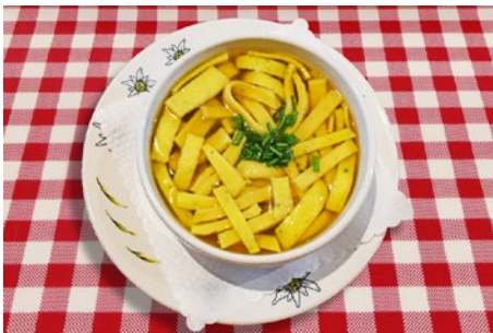
Beef clear soup (1,3,7,9,16) with homemade pancake stripes