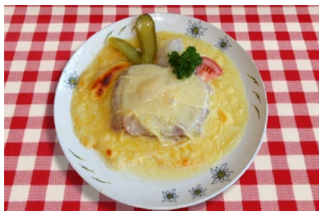
Melted Swiss cheese on bread with ham (1,7) (alcoholic)