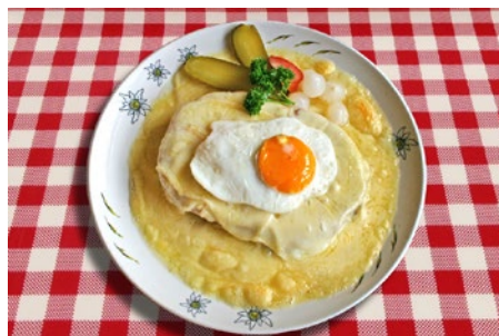
Melted Swiss cheese on bread with ham and a fried egg (1,3,7) (alcoholic)