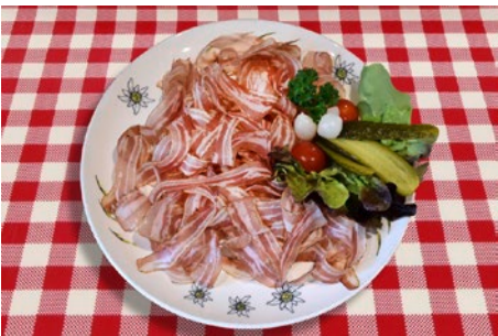
Swiss air-dried bacon from the Bernese Oberland