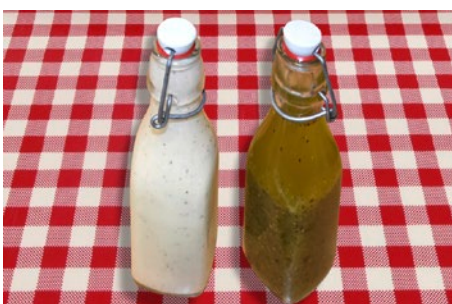
Home-made salad dressing french (3,9,10,16) italian (9,10)