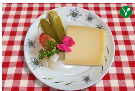
Portion of cheese (7) from the alp Sefinen