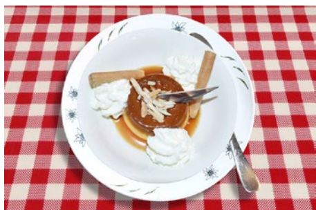
Caramel flan (1,3,6,7,8) with whipped cream