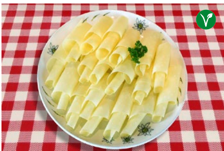
Wafer thin slices of Swiss moun- tain cheese (7) from the alp Schilt